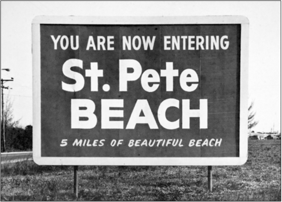
Welcome sign at the beach end of McAdoo Bridge, circa 1921.